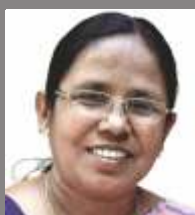
HEALTH MINISTER KERALA Smt. K. K. Shailaja Teacher