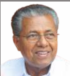
CHIEF MINISTER, KERALA Sri. Pinarayi Vijayan