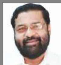
TOURISM MINISTER KERALA Sri. Kadakampally Surendran